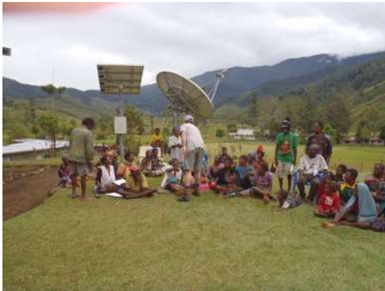
Photo1: Landowners at the Warden's Court Hearing at Tolukuma